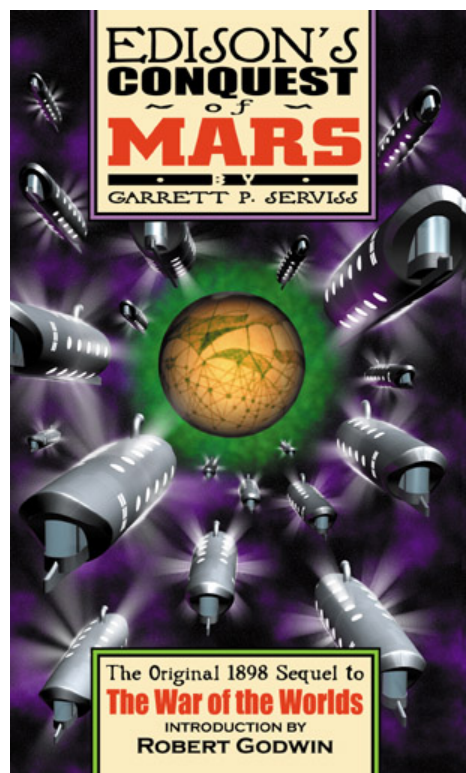
Apogee Books Science Fiction # 1

From the editorial staff that brought you the "The NASA Mission Reports" Apogee Books Science Fiction is a new imprint of important space-related fiction